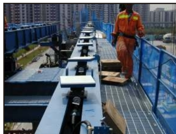
Incremental Launching / Frame Forming Work for Bridge Construction

Suitable handle shall be provided with cylinders whose weight is more than 20 kg.